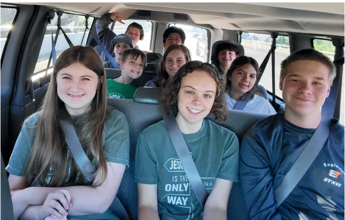
2024 CYIA missionaries headed out for a day of clubs last summer

Know a teen who would love this opportunity? Share CYIA with them—it's more than a summer program; it's a life-changing experience!