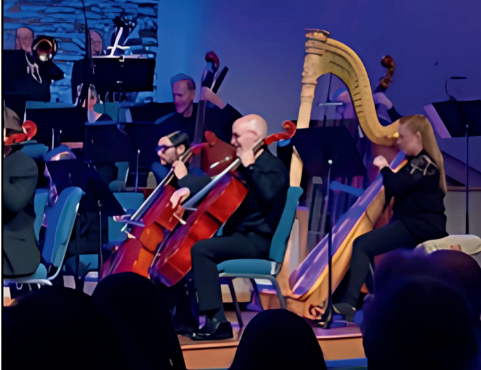
Nashville Praise Symphony

Thank you for being part of this incredible evening.